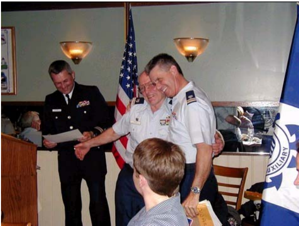
Left: Bing and Dave share a “moment.”

DEPARTMENT OF TRANSPORTATION U.S. COAST GUARD FSO-PB 21 1NR 39 A ALLEY ROAD CUMBERLAND, MAINE 04021 OFFICIAL BUSINESS PENALTY OF PRIVATE USE $300