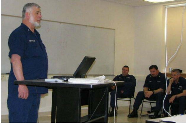
2005 Operations Workshop