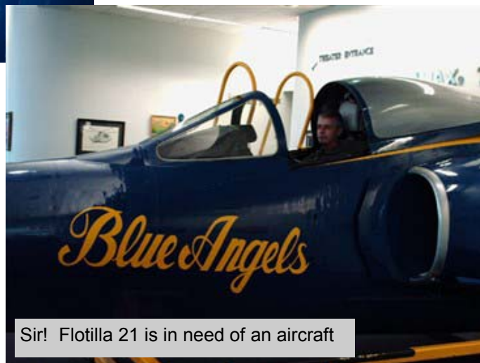
Sir! Flotilla 21 is in need of an aircraft