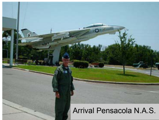
Arrival Pensacola N.A.S.