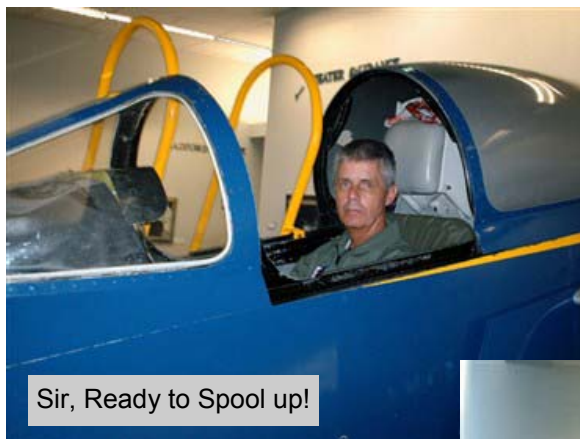
Sir, Ready to Spool up!