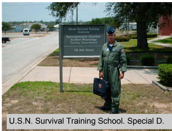
U.S.N. Survival Training School. Special D.