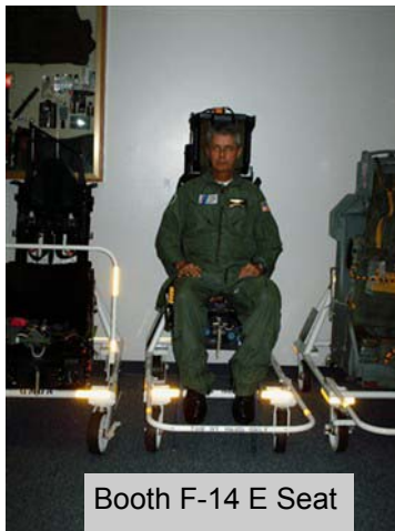
Booth F-14 E Seat