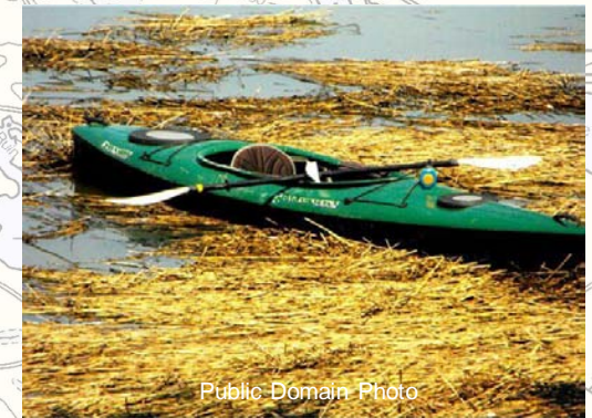
Public Domain Photo